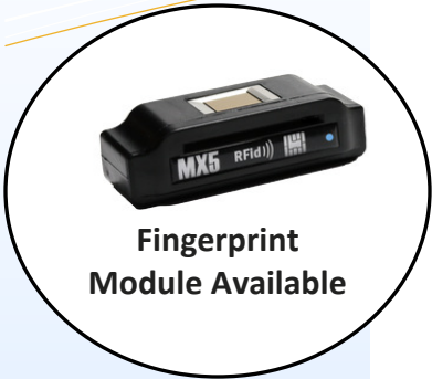
Fingerprint Module Available