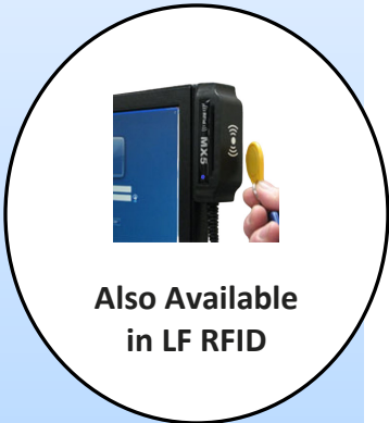
Also Available in LF RFID

Unlike any other reader on the market today, you will not need to stock different models to support USB VRS Serial, Keyboard, HID or Custom applications. Using the MX5 Utility you can select the desired communication (HID KB, VRS, HID Report output setting, save your changes into Flash memory of the MX5 device and your MX5 device is ready to meet your needs.