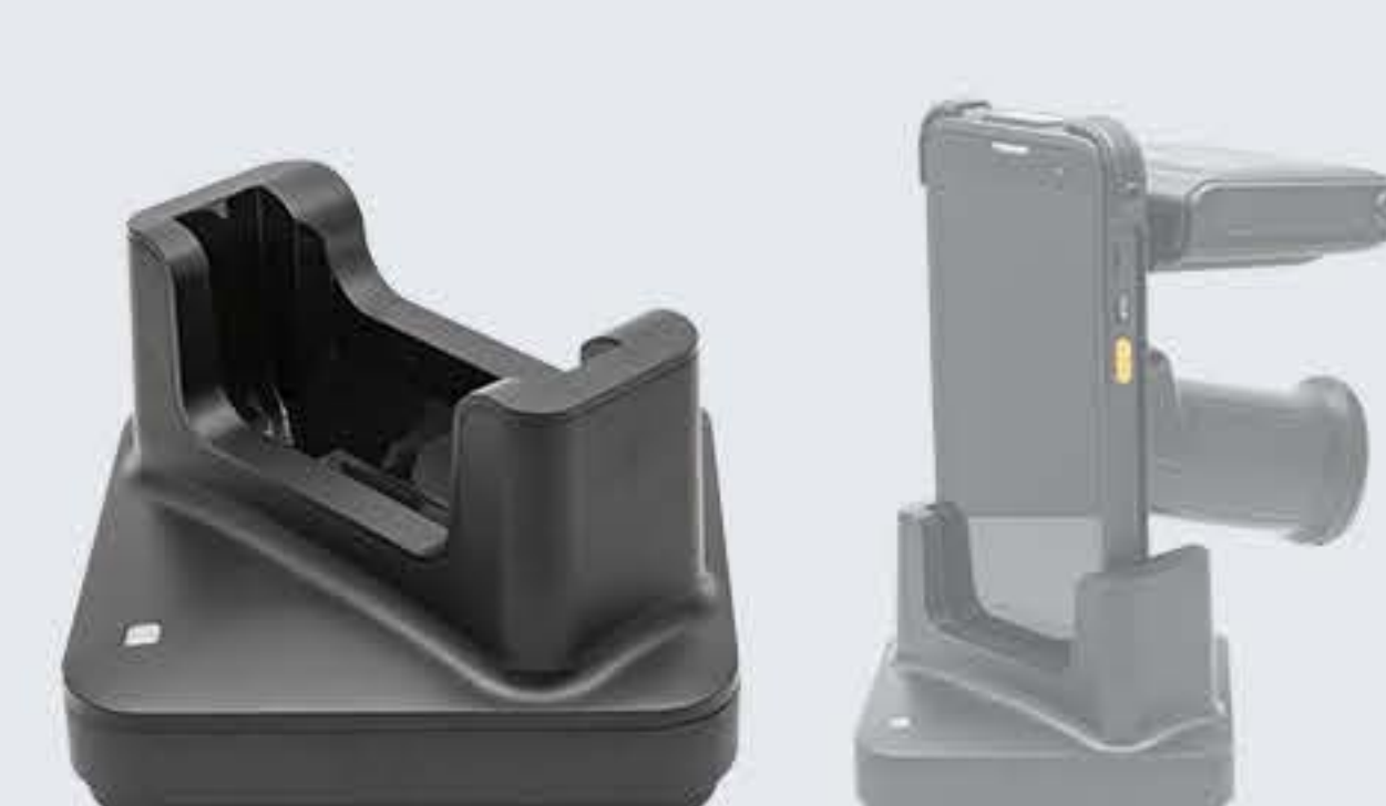
CRD-C66-DP C66 charging cradle, only for device with pistol grip or device with UHF, use with DCPWR-12V2A-XX adapter.