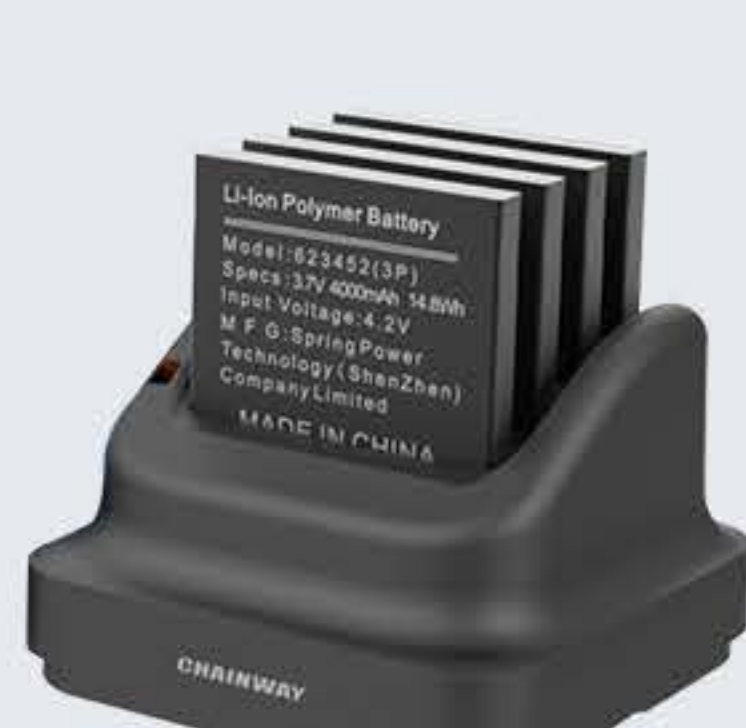
CRD-C66-MBC Charging Cradle for main battery, up to 4 slots, use with DCPWR-12V2A-XX adapter.