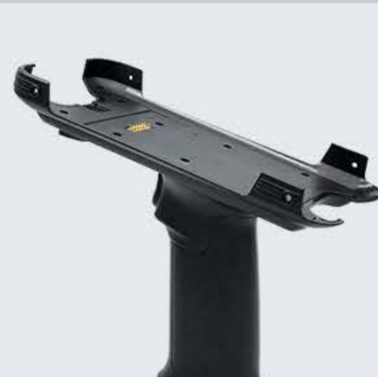
RB-C66-PS Snap-On Trigger Handle and Rugged Boot Kit, use with optional pistol battery 4 pcs M1.6 screws are necessary.