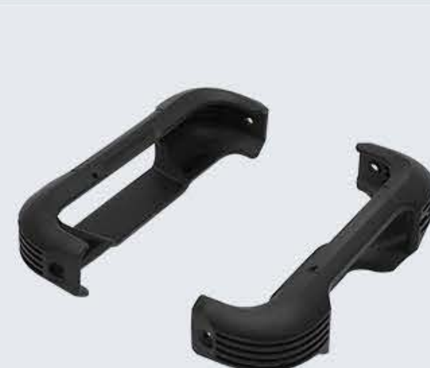
RB-C66-PR Protective rubber bumper, upper and lower 4 pcs M1.6 screws are necessary.