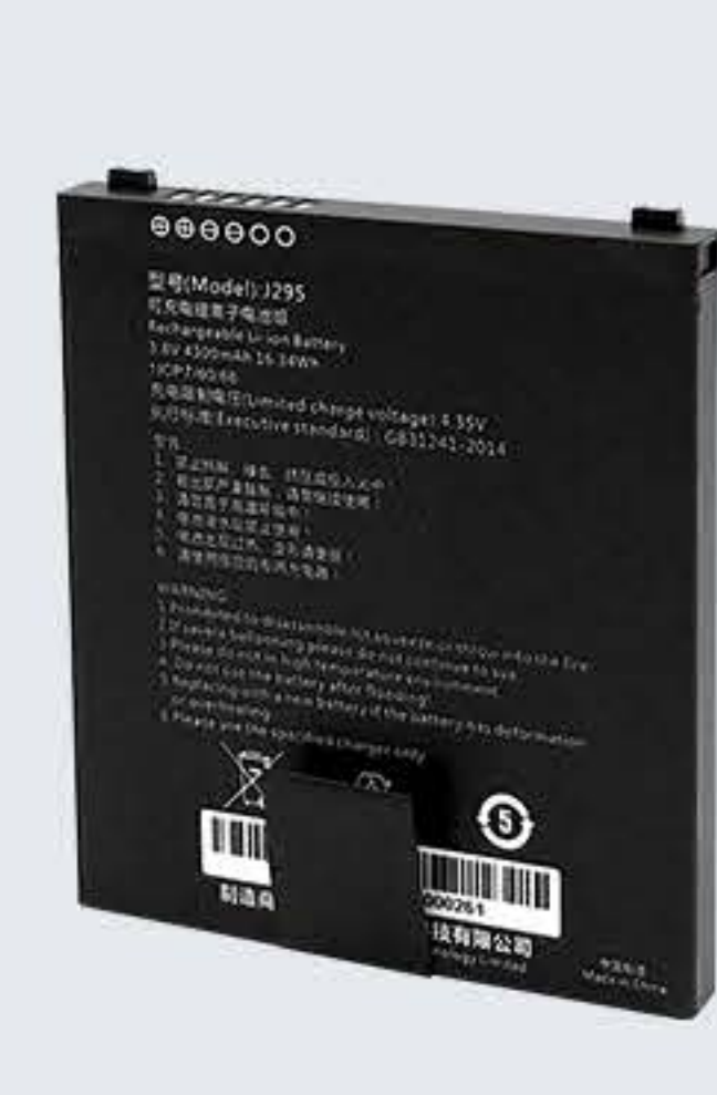
BTRY-C66-43MA 4300mAh Li-Ion battery, 3.8V output