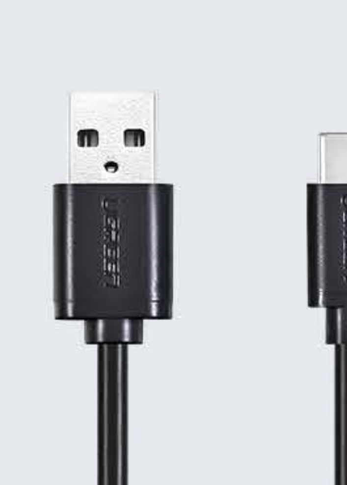
DC-BK-TypeC 1.0 meter Type-C cable