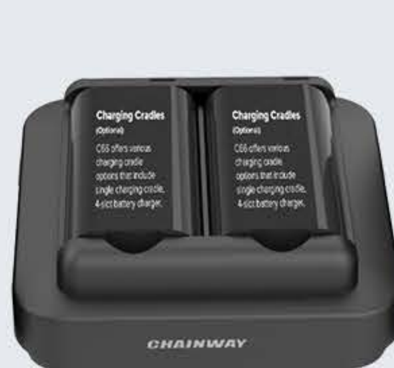
CRD-C66-PBC Charging Cradle for pistol battery, up to 2 slots, use with DCPWR-12V2A-XX adapter.