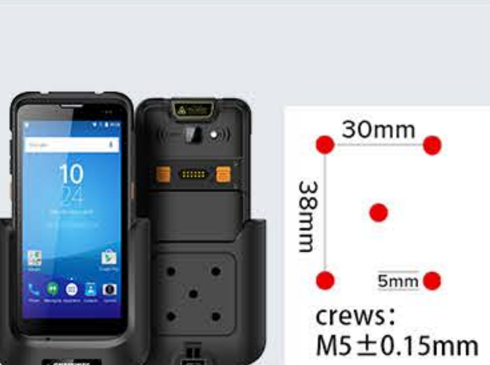
CRD-C66-VC Vehicle Charging Cradle, with type-C, use with DC-BK-TypeC cable. Car holder and car adapter need to be purchased separately