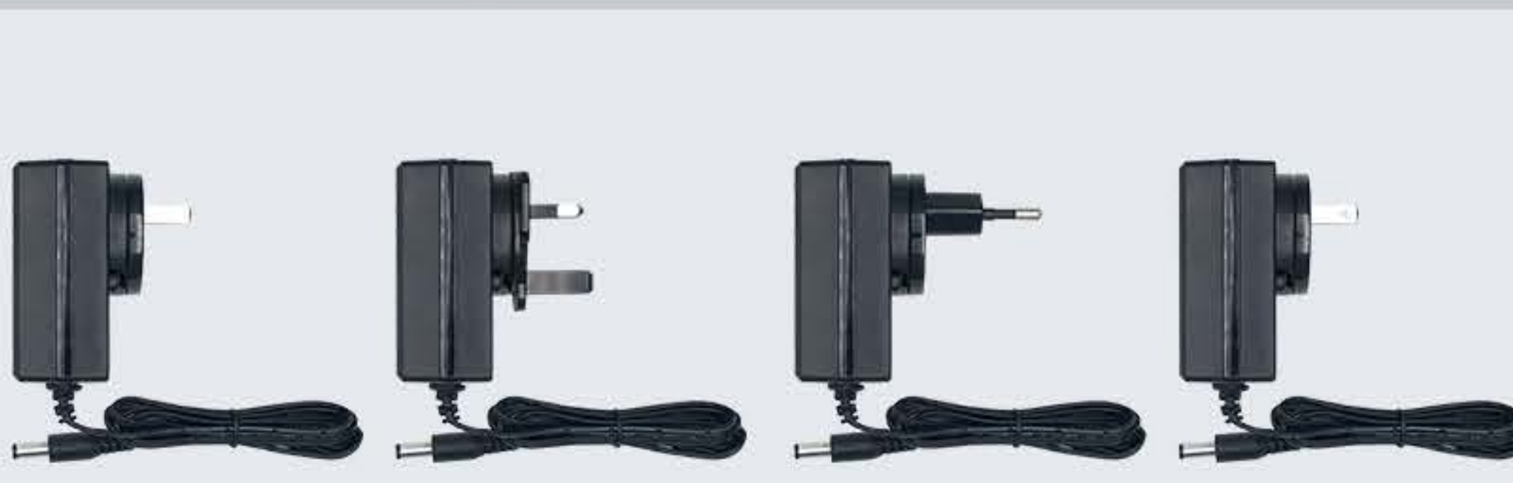
DCPWR-12V2A-XX Adapter(CN/EU/UK/US), I/P: 100-240V, O/P: 12V2A, DC