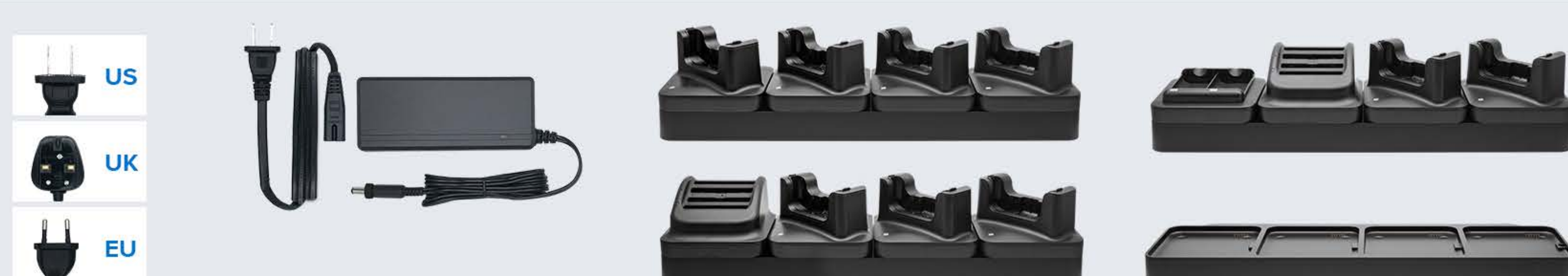
CRD-MCB The base of 4-slots charging cradle set for 4 pieces of cradle, use with DCPWR-12V5A-XX adapter. For load balance, recommendation: 1. 4 x cradle for device 2. 3 x cradle for device + 1 x cradle for main battery 3. 2 x cradle for device + 1 x cradle for main battery + 1 x cradle for pistol battery