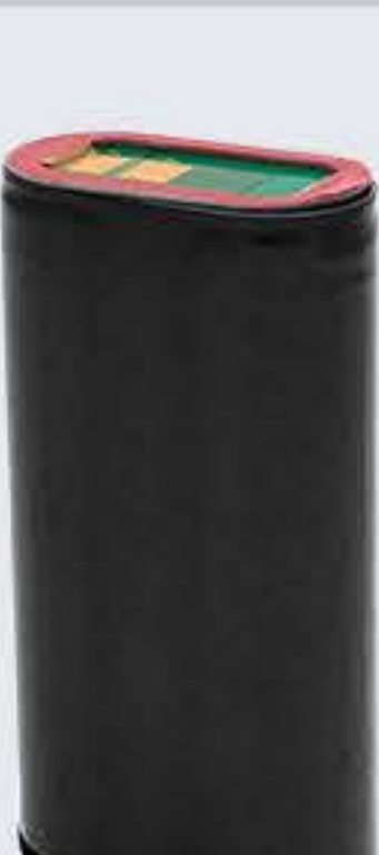
BTY-C66-PB Pistol battery, 5200mAh