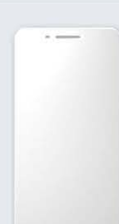
SP-C66 Tempered glass screen protector