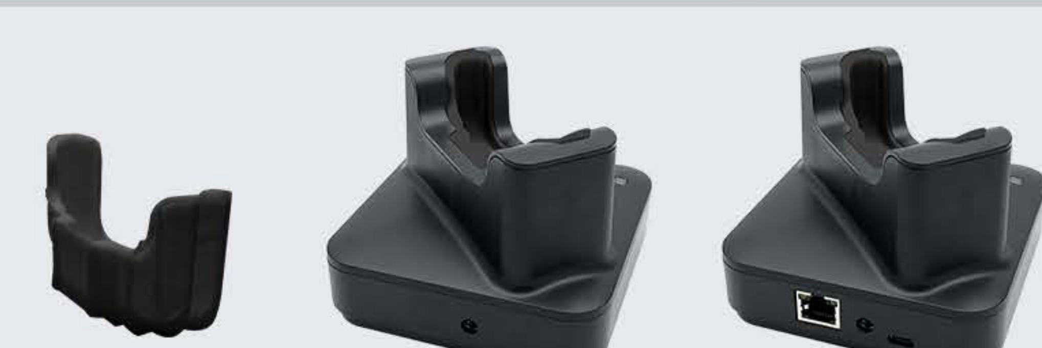
CRD-C66-RBC/CRD-C66-RBCE Charging Cradle for device, use with DCPWR-12V2A-XX adapter. CRD-C66-RBCE is an advanced CRD-C66-RBC, w/sync, w/ethernet, w/DC. The cradle cup has an insert that must be removed prior to inserting the C66 with Rugged Boot.