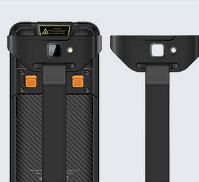
RB-C66-HS Hand strap with buckle 2 pcs M1.6 screws are necessary.