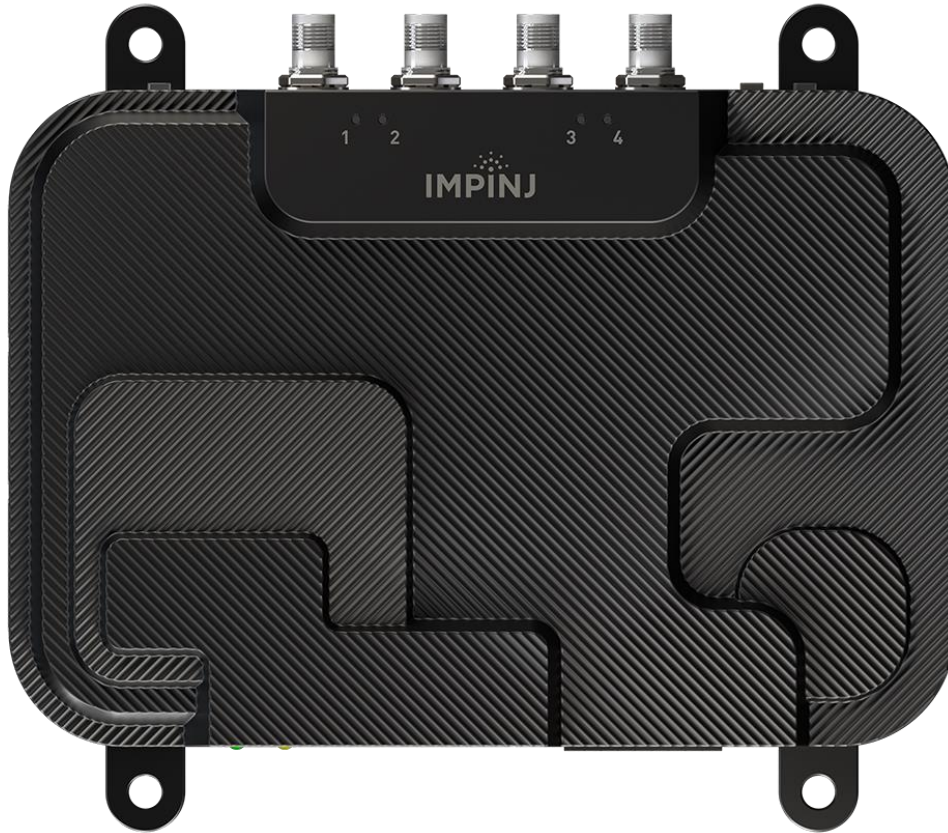
Figure 2: Impinj R700 Bottom View