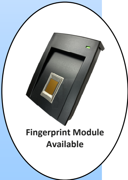
Fingerprint Module Available