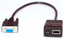
USB to RS232 Converter Cable Available