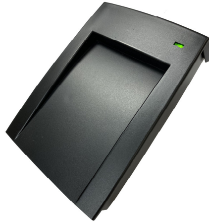
Part # MX5PT

MX5PT is a Tabletop Dual Frequency Reader Supporting 125 KHz Low Frequency and 13.56 MHz High Frequency RFID Cards all in one reader!